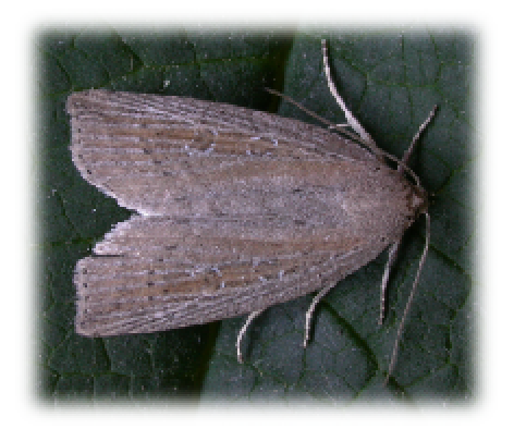
A full species list received to date is included at the end of this article.