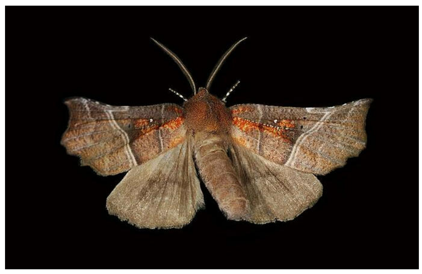
Herald Moth, Pamber