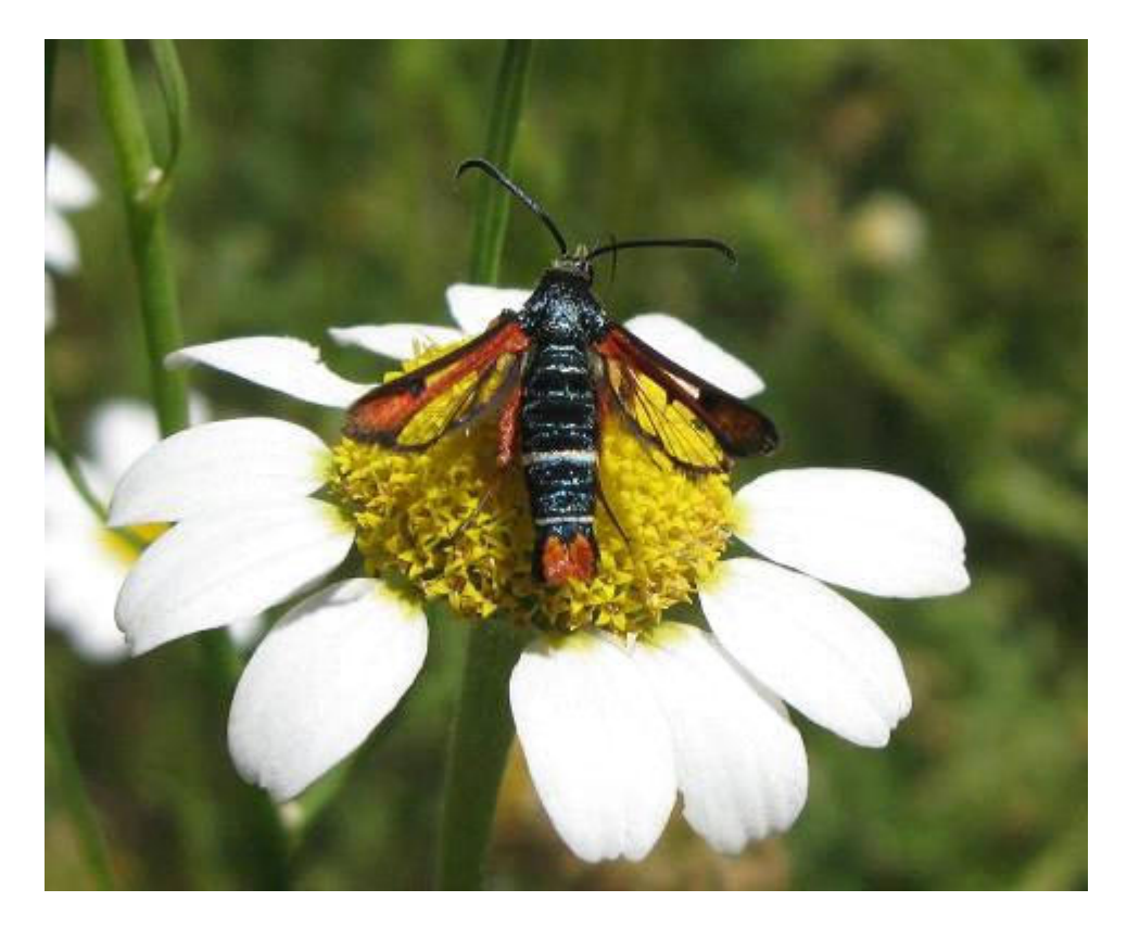
Fiery Clearwing, Abelle de la Conca, Catalan Pyrenees 20 Jun 2010